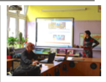
Slovenian partner presentation